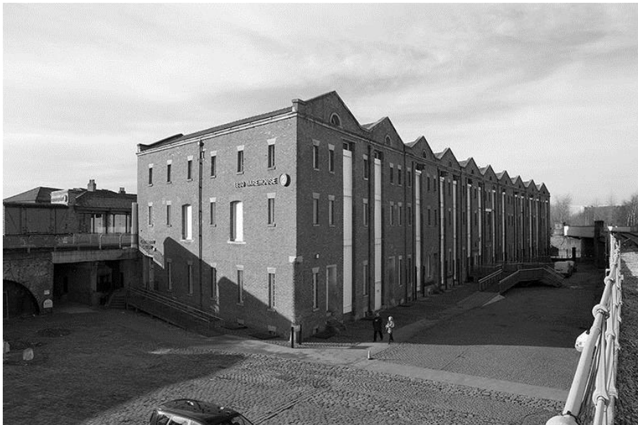
Fig. 1 - The 1830 Warehouse

One large four-storey building is “The 1830 Warehouse”, the world’s first railway goods warehouse. This is largely intact from Victorian times – brick-built, wooden floors, timber and cast iron pillars, large windows and hydraulic hoists, all still present. In 1998, the top floor was empty but planned to become the “Futures Gallery” to show communications, from writing to railways, and telegraph to television. It was felt that this would be a suitable background to display the “Baby”, and plans were made to move it there.