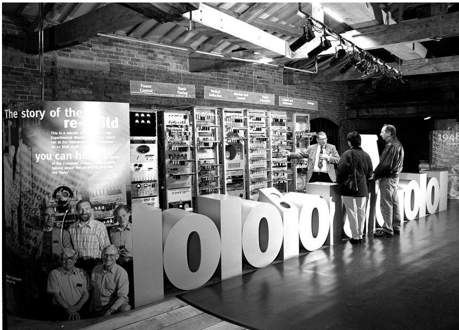
Fig. 2 - “Futures Gallery” – Top Floor of 1830 Warehouse – 1998 to 2005

As already mentioned, the installation was handed over to MOSI a few months later, and there it could be shown to the public in a spacious and authentic-looking setting. There was no “passing trade” – museum visitors had to find out from signage and enquiry where the “Baby” was, and then make the effort to ascend to the top floor to find it. Nevertheless there was a steady stream of visitors and probably very few days with no visitors. There were sufficient volunteers available to respond to visitors on Tuesdays from 10:00 to 16:00 with a pattern of scheduled demonstrations at 12:00 and 14:00. On other days a ‘visitor present’ detector triggered a voice commentary with synchronised spotlights to enliven the exhibit and educate the visitor.