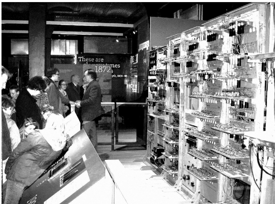
Fig. 6 - Visitors interested in “An Icon of Manchester Science”

A week before Christmas 2010 a power feed was available on the new site and the work of re-commissioning could begin. Visual checks showed that at least 50 of the little glass diodes had bent pins or cracks in the glass, not always fatal, but a cause for concern. This was due to suffering in the “builders’ workshop” and insufficient recognition of the vulnerabilities by staff moving the machine. After weeding out defective diodes, and locating and repairing various broken or disconnected wires, the