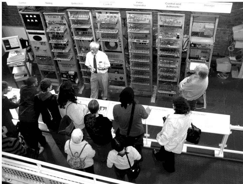
Fig. 4 - Ground floor of Main Building – 2007 to 2009

Once again, the machine was un-wired and disassembled, to vacate the space needed by Connected Earth. It took some time to prepare the new site in the Main Building which was a little smaller than we were used to, and care had to be taken to ensure the safety of visitors. So the machine was in limbo for a couple of months before the volunteer team could get access to re-assemble and re-wire. Once power was available on-site, it took a day to confirm the computer was in good order and ready to display and demonstrate to the public.