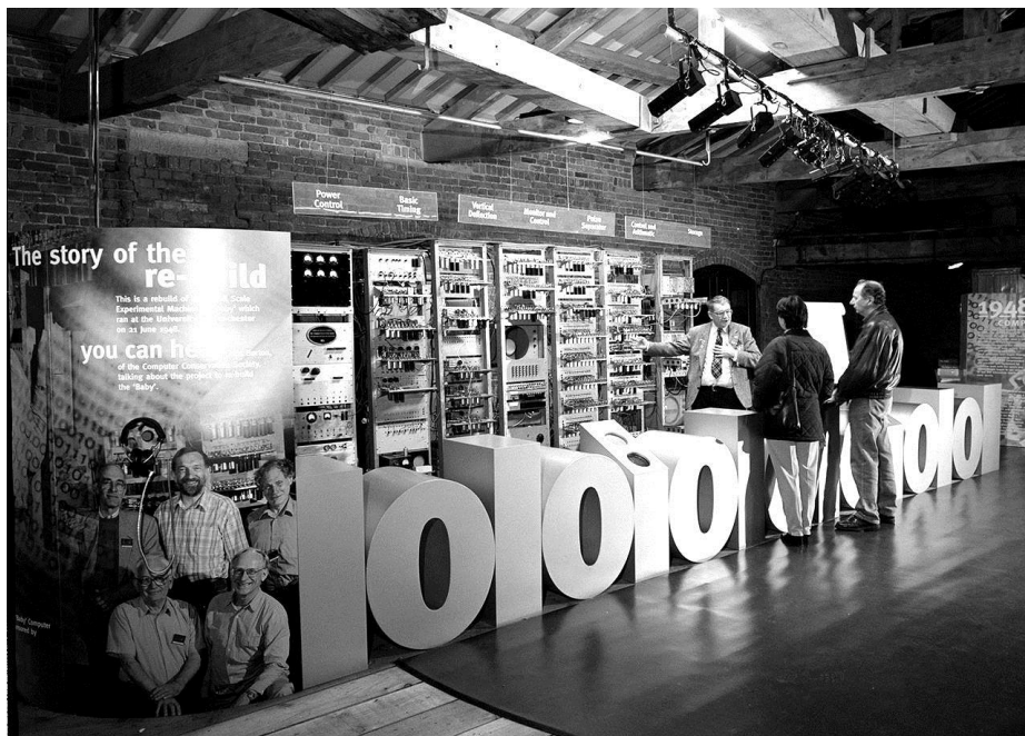
Fig. 2 - “Futures Gallery” – Top Floor of 1830 Warehouse – 1998 to 2005

As already mentioned, the installation was handed over to MOSI a few months later, and there it could be shown to the public in a spacious and authentic-looking setting. There was no “passing trade” – museum visitors had to find out from signage and enquiry where the “Baby” was, and then make the effort to ascend to the top floor to find it. Nevertheless there was a steady stream of visitors and probably very few days with no visitors. There were sufficient volunteers available to respond to visitors on Tuesdays from 10:00 to 16:00 with a pattern of scheduled demonstrations at 12:00 and 14:00. On other days a ‘visitor present’ detector triggered a voice commentary with synchronised spotlights to enliven the exhibit and educate the visitor.