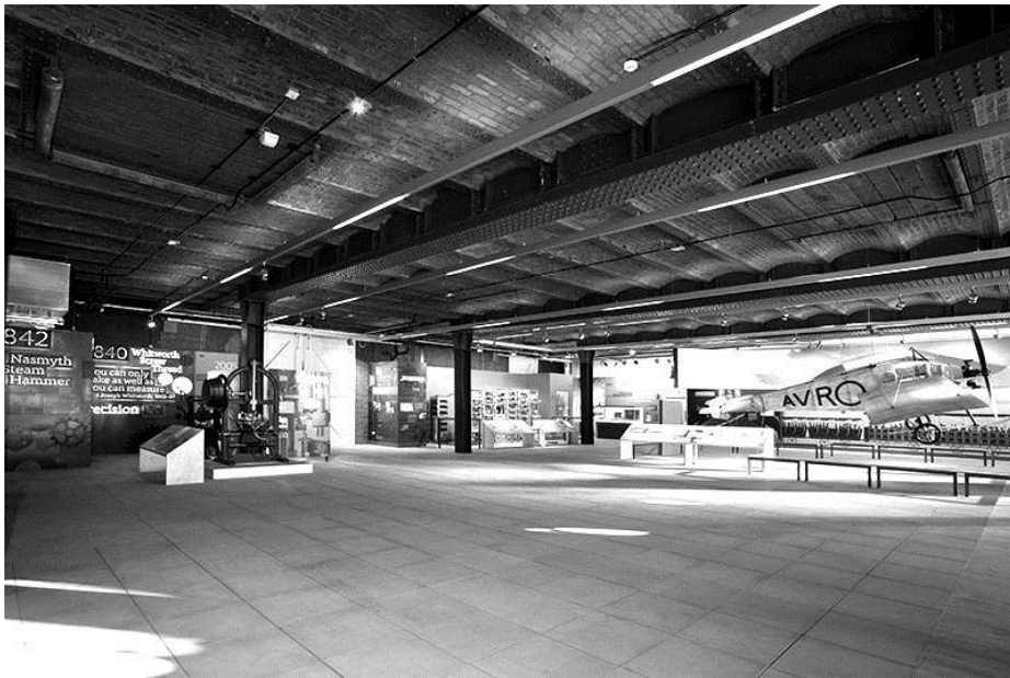
Fig. 5 - The spacious Revolution Manchester Gallery – “Baby” in far corner

The expectation was that the “Baby” would be safe in storage together with the large quantity of spare valves (vacuum tubes) and other components and associated test equipment and documents. There was insufficient availability of power to be able to operate the whole machine for testing purposes while in storage, though there was the prospect of applying power to separate parts of the system.