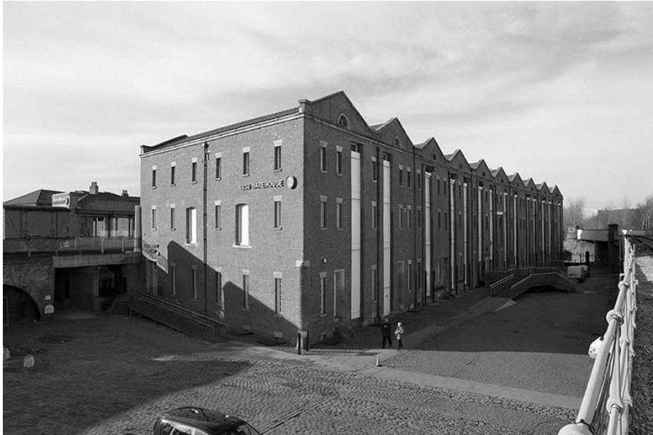
Fig. 1 - The 1830 Warehouse

One large four-storey building is “The 1830 Warehouse”, the world’s first railway goods warehouse. This is largely intact from Victorian times – brick-built, wooden floors, timber and cast iron pillars, large windows and hydraulic hoists, all still present. In 1998, the top floor was empty but planned to become the “Futures Gallery” to show communications, from writing to railways, and telegraph to television. It was felt that this would be a suitable background to display the “Baby”, and plans were made to move it there.