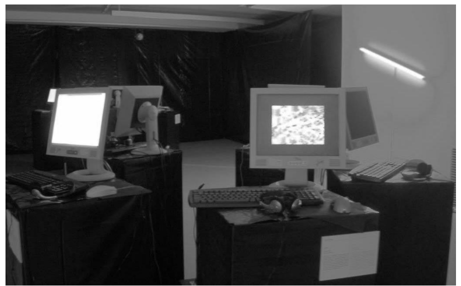
Fig. 6: Example of games in art context from Bratislava in 2009.