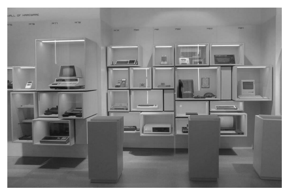
Fig. 1: Examples of two different museum exhibitions of games: one from the Berlin computer game museum in 2012.