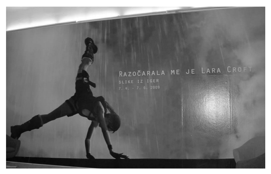
Fig. 5: Three different examples of games in art context: one from Ljubljana in 2009.