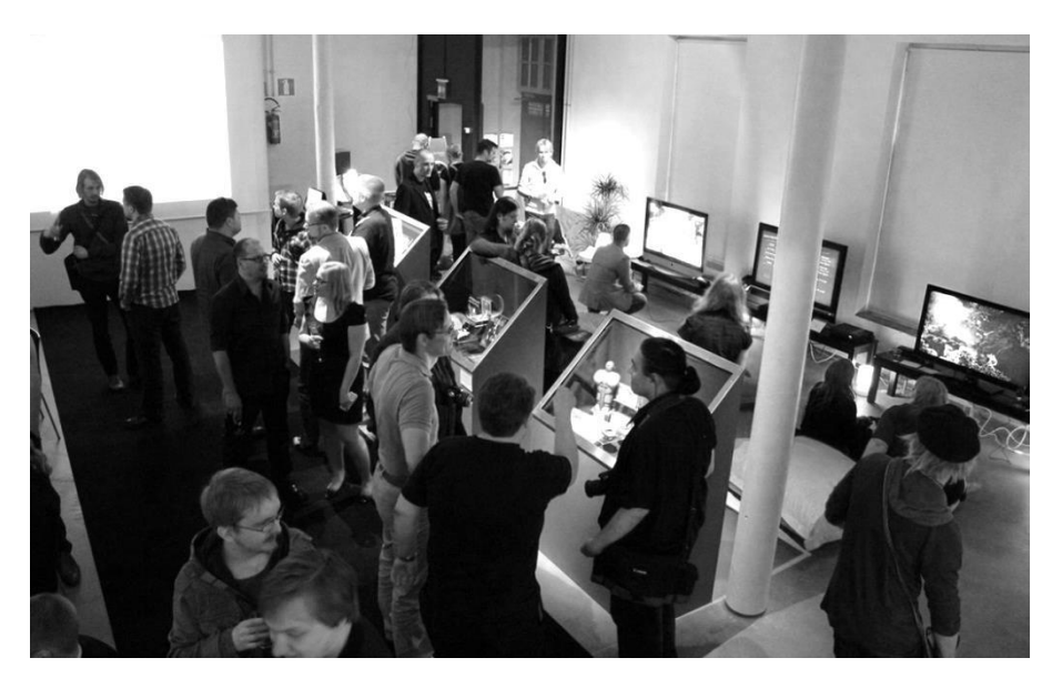
Fig. 10: An example of a national exhibition of games and game industry: Finnish games then and now, Tampere 2012.

It is challenging to design exhibitions on the history of games for different kinds of audiences and make the subject understandable and interesting. It is problematic, in many situations, to ignore the changes in the digital gaming and cultural and historical contexts, but it is further troublesome if these changes are presented mechanically and chronologically. General exhibitions are able to offer a great overview of games and game cultures and related phenomena, but they can also be too generic. (Saarikoski 2010, 137) Whereas special theme exhibitions, like for example the Game Masters exhibition in ACMI (Australian Centre for the Moving Image) and Te Papa (New Zealand's national museum), which is about the most influential game designers, can provide more details and a more inclusive experience to the audience than a general exhibition that provides, in the worst-case scenario, only a little information about this and that