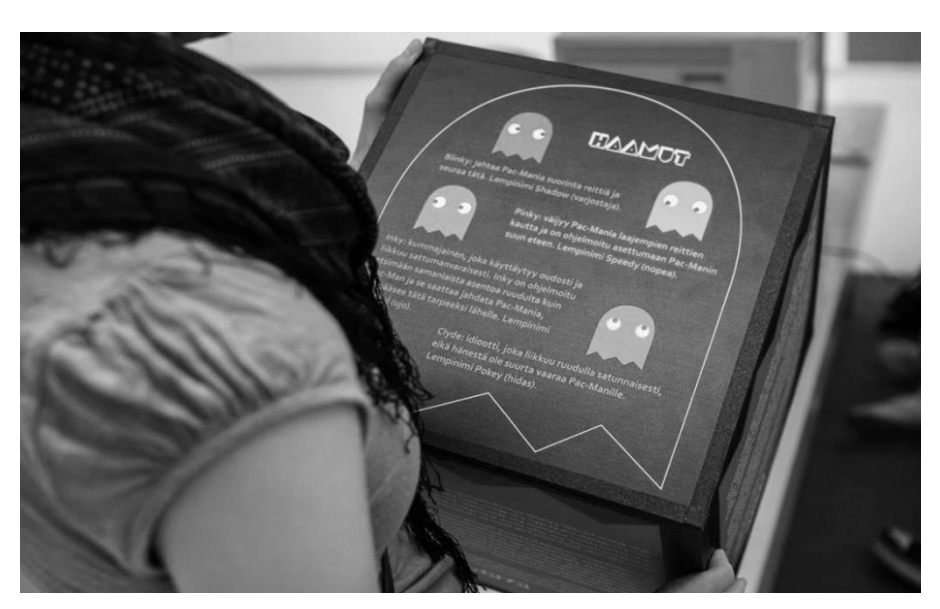
Fig. 8: The Pac-Man cube in Pori Art Museum.

exhibition in Pori Art Museum (Finland 2011) where the text was printed in the cube<sup>3</sup>. This idea got its inspiration from an art exhibition design and the art museum that provided the environment without walls. Otherwise, in this case, the exhibition approach was mainly cultural-historical. Games could also elicit questions from the audience, for example about the artistic qualities of digital games, instead of placing information, that they have already interpreted, onto the wall (Turpeinen 2005, 189–191; Naskali 2012, 85).