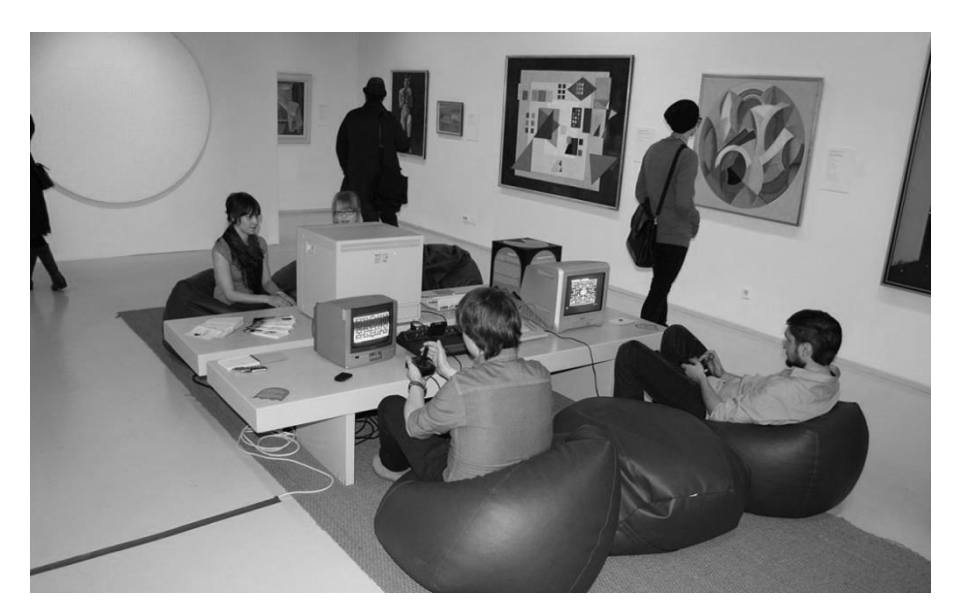
Fig. 7: Example of games in art context from Finland in 2011.

Digital games have inspired many artists and their artwork, and games can be considered as art itself. The relationship between art and digital games can be perceived from at least four different perspectives: 1) games as art, 2) artistic features in games, 3) game related subjects in art and 4) interactivity and other playable features in art. In one way or another, these approaches have been included in several temporary exhibitions such as The Art of Video Games (US, 2012-), C:/DOS/RUN – Remembering the 80s Computer (New Zealand 2005), I am 8-bit (US, exhibitions from 2005-), Serious Games (UK 1996-1997), and also in the Applied Design exhibition<sup>2</sup> (US, 2013-2014) that approach video games along with other designs from the interaction design point of view (Naskali 2012).