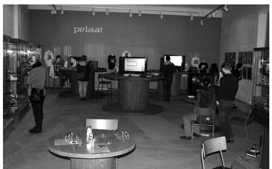
Fig. 2: And one from Salo Art Museum in 2009.