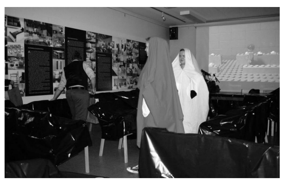
Fig. 9: A Pac-Man in Flesh game performance in Pori Art Museum.

not have to be, and do not have to automatically be the same. Nevertheless, the museum type can still inspire the exhibition design on a new level and bring something new to the way of introducing games.