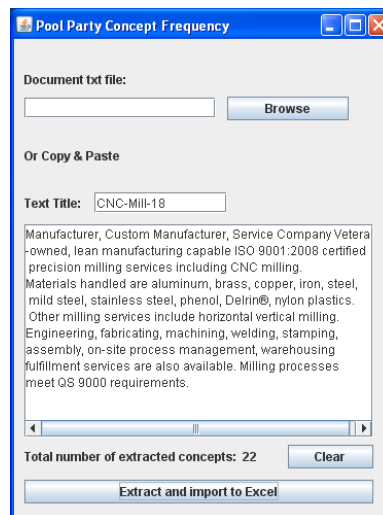
Fig. 1: The GUI of the concept extractor program

In order to rapidly analyze a large sample and improve the statistical significance of the results, a Java-based concept extraction program was developed for automatically extracting ManuTerms concepts from the imported text. Error! Reference source not found. shows the user interface of the concept extraction program. The extractor tool exports the identified concepts for each supplier to an Excel worksheet for further analysis. Fig. 2 shows the ManuTerms concepts extracted from the profile of one of the suppliers of CNC milling services and sorted