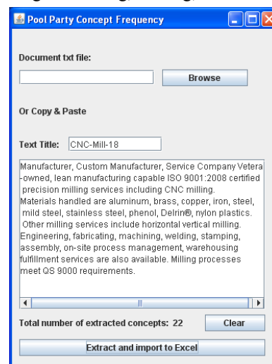
Fig. 1: The GUI of the concept extractor program

In order to rapidly analyze a large sample and improve the statistical significance of the results, a Java-based concept extraction program was developed for automatically extracting ManuTerms concepts from the imported text. Error! Reference source not found. shows the user interface of the concept extraction program. The extractor tool exports the identified concepts for each supplier to an Excel worksheet for further analysis. Fig. 2 shows the ManuTerms concepts extracted from the profile of one of the suppliers of CNC milling services and sorted