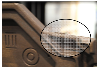
Figure 3 Cast iron parts with flash on the edges

A series of IDEF diagrams were created to support the implementation of part traceability at an automated cell at company 1 (a commercial product cast iron foundry manufacturer). The foundry wanted to look into automating traceability data collection at the CNC finishing and thereby reducing the manual handling of heavy parts with flash on its edges.