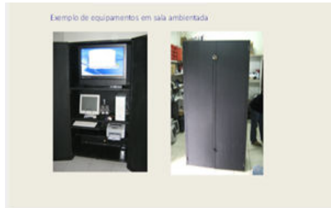
Figure 5 Reception equipments at the remote classrooms.

The described education project has been implement at Piauí State and is running with its first group of students. So, results on effective learning are not yet available. However, it is expected that shall be reached advantage as good as the ones got in a similar project held in Amazonas State, shown in Table 2.