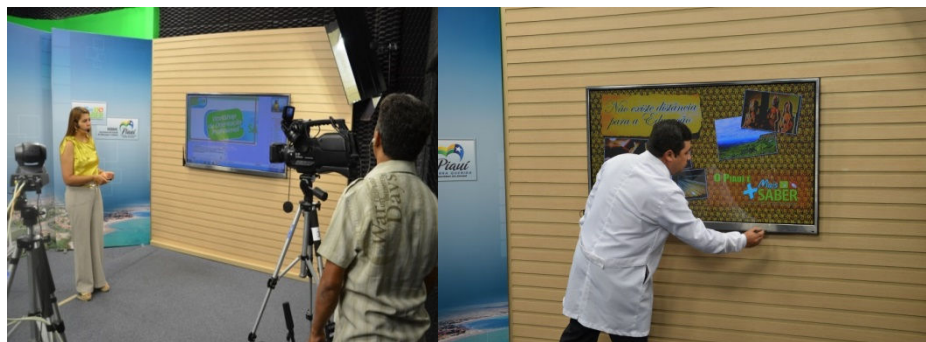
Figure3 Broadcast studio in Teresina

The following are illustrative figures of the implementation of the project, provided by the authors.