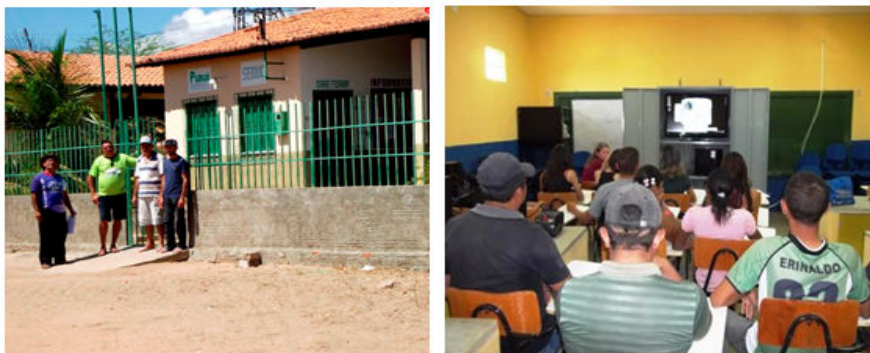
Figure 4 Example of a school in Vila Nova do Piauí, a town about 350 miles away from the capital