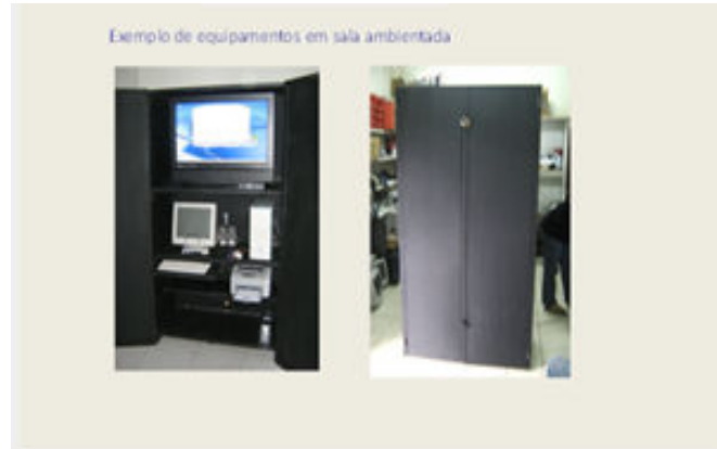
Figure 5 Reception equipments at the remote classrooms.

The described education project has been implement at Piauí State and is running with its first group of students. So, results on effective learning are not yet available. However, it is expected that shall be reached advantage as good as the ones got in a similar project held in Amazonas State, shown in Table 2.