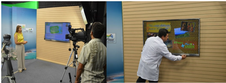
Figure3 Broadcast studio in Teresina

The following are illustrative figures of the implementation of the project, provided by the authors.