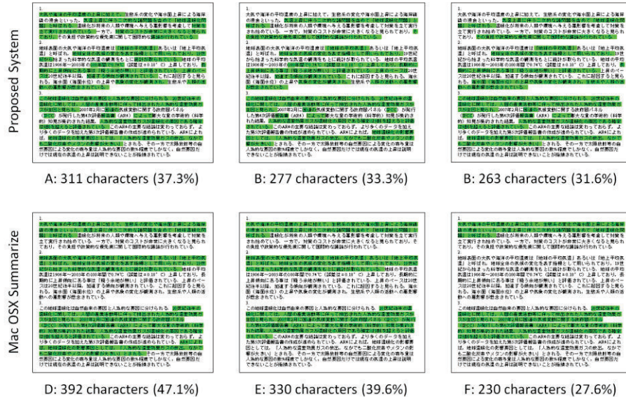
Fig. 2. Comparisons in terms of information

Fig. 2 represents which information contents remain in each summary. The contents corresponding to the shaded parts in the original document have been judged to remain. It is observed that the summaries created by the proposed approach have covered whole area of the original document. Whereas, those made by Mac OSX Summarize only capture fragmentary information especially when the length is short, since the summarization function takes the extractive method.