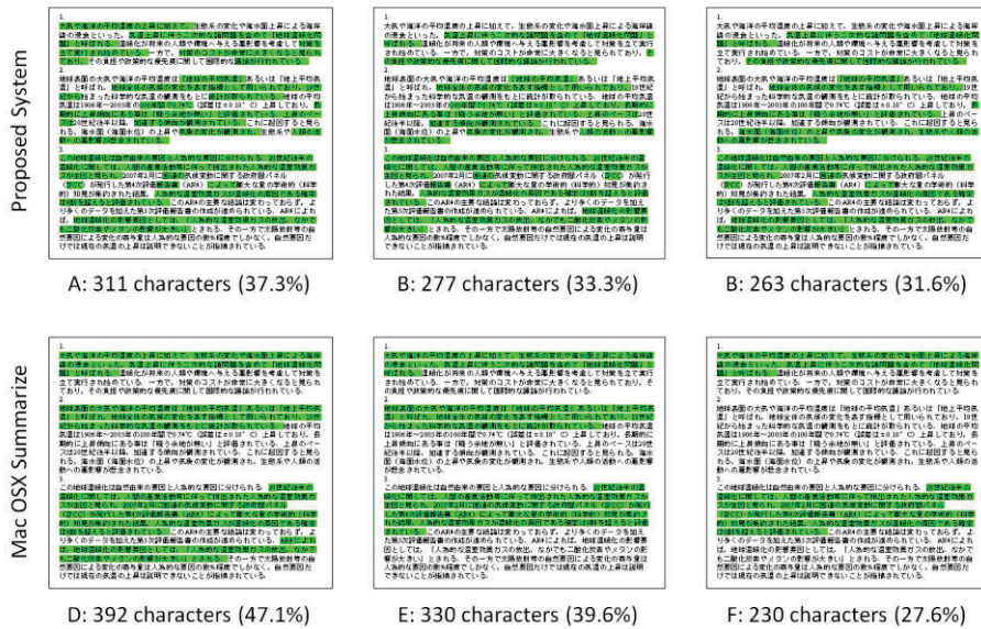
Fig. 2. Comparisons in terms of information

Fig. 2 represents which information contents remain in each summary. The contents corresponding to the shaded parts in the original document have been judged to remain. It is observed that the summaries created by the proposed approach have covered whole area of the original document. Whereas, those made by Mac OSX Summarize only capture fragmentary information especially when the length is short, since the summarization function takes the extractive method.