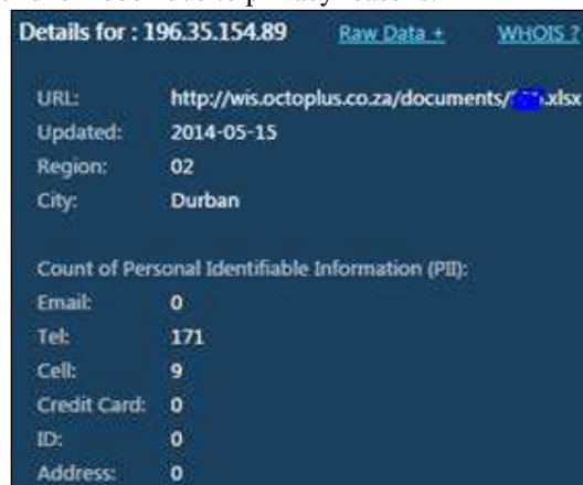
Fig. 3. PII Details [5]

Zooming into the map allows for the opening of specific server nodes and displays more details on that particular server. Fig. 3 shows the details on a website URL that has been opened in the application, indicating that the particular website is responsible for leaking 171 telephone numbers and nine cell phone numbers. The approximate geo-location for this web-server is identified as Durban, South Africa. The complete URL for the file found is hidden due to privacy reasons.