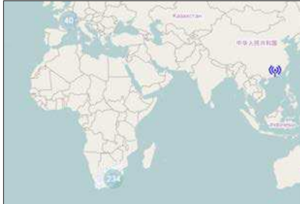
Fig. 2. PII Visualisation [5]

Zooming into the map allows for the opening of specific server nodes and displays more details on that particular server. Fig. 3 shows the details on a website URL that has been opened in the application, indicating that the particular website is responsible for leaking 171 telephone numbers and nine cell phone numbers. The approximate geo-location for this web-server is identified as Durban, South Africa. The complete URL for the file found is hidden due to privacy reasons.