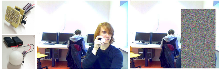
Fig. 3. A first proof-of-concept implementation of the DCI as opt-out: only regions surrounding a detected infrared beacon are anonymised.

In a first proof of concept, we implemented a DCI camera as an opt-out system instead of opt-in . I.e. instead of anonymising everybody by default except those who opt-in, nobody is anonymised except those who opt-out (conceptually similar to [24]). This was done to firstly abstract from the person-identifying image recognition. We designed an infrared LED beacon that is picked up by the camera to subsequently anonymise the region around this beacon. Figure 3 shows the practical results. The anonymisation is done with the cryptographic scheme as described above. With sufficiently reliable person-identifying algorithms, the system can easily be transformed into the DCI opt-in variant.