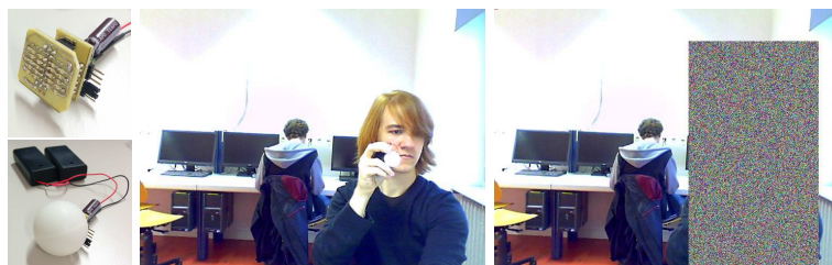
Fig. 3. A first proof-of-concept implementation of the DCI as opt-out: only regions surrounding a detected infrared beacon are anonymised.

In a first proof of concept, we implemented a DCI camera as an opt-out system instead of opt-in . I.e. instead of anonymising everybody by default except those who opt-in, nobody is anonymised except those who opt-out (conceptually similar to [24]). This was done to firstly abstract from the person-identifying image recognition. We designed an infrared LED beacon that is picked up by the camera to subsequently anonymise the region around this beacon. Figure 3 shows the practical results. The anonymisation is done with the cryptographic scheme as described above. With sufficiently reliable person-identifying algorithms, the system can easily be transformed into the DCI opt-in variant.