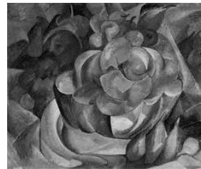
Braque 'Fruit Dish', 1908 ( 'Plat de fruits' )