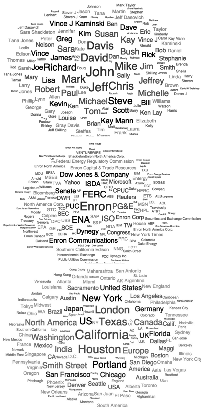
Figure 3. Identified named entities (persons, organizations and locations).