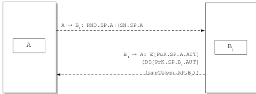
Fig. 2: Simplified diagram of subprotocol: State 3

authentication of users. These two subprotocols provides mutual entity authentication. Because the messages sent are independent of each other, it is important to note that the subprotocol of state 4 is unambiguously symmetrical (similar) to the subprotocol of state 3. Therefore, in the description of these subprotocols we will focus only on the subprotocol of state 3. It is easy to observe that in other subprotocols there is no possibility of possessing by Intruder important data, so correctness of the whole protocol from security and authentication point of view is assured. The analysis of the correctness and the security of subprotocol of state 3 is made on the basis of the data transmission diagram (Fig. 2) and the experimental results obtained by using formal methods and aforementioned automatic tools.