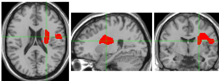
Fig. 3. Group differences of the ADC maps between poor and good motor outcome with a spatially regularized SVM ( z=20 mm, x=28 mm and y=-8 mm in the MNI-space).

No regions were detected by the univariate analyses. The spatially regularized SVM detected significant changes predominantly localized in the WM (Fig. 3). The larger part of the detected cluster included the corticospinal tract at the level of the internal capsule. The smaller part was more superficial and was originating from the lower part of the motor and premotor cortex.