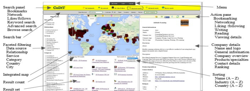
Fig. 2. The CoDiT search interface

The CoDiT search interface: The CoDiT search interface facilitates three types of search: a basic search (direct keyword search which is either full text search – keyword appearing anywhere in company information – or user may restrict the search to one of four fields: name, location, industry, or service of the company), an advanced search (where user can design a search query with combination of different parameters including name, keyword, location, industry, and service), and a navigational search (where user can browse the companies by alphabet, location, industry or service). Figure 2 presents the CoDiT search interface after the execution of a basic keyword search.