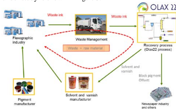
Figure 3 Overview of the system, with outputs

The SuWAS project (Sustainable Waste Management Strategy for Green Printing Industry Business) is an ECO-INNOVERA project aiming at the economic, social and environmental assessment of the deployment of a new technology at EU scale. This technology is patented and owned by the University of Alicante. The patent concerns the process to recover the waste-ink components of the (solvent-based) flexographic printing industry to generate secondary products. It is an alternative to the current costly (120 Euros/ton) mandatory incineration (hazardous waste). A general overview of the system under study is shown in Figure 3.