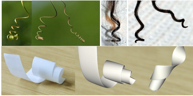
Fig. 1: Many physical strands exhibit a smooth curled geometry with linear-like curvature profile, which is captured and deformed accurately thanks to our super-clothoid model [4]. From left to right and top to bottom, three examples of real strands whose shapes are synthesized and virtually deformed in real-time using a very low number of 3D clothoidal elements: a vine tendril (4 elements), a hair ringlet (2 elements), and a curled paper ribbon (1 single element).

I will first introduce the mechanical equations for inextensible thin elastic rods, namely the Kirchoff equations, which take the form of second order partial differential equations subject to boundary conditions. Noting that curvatures and twist play a major role both in the geometric and dynamic description of this model, we have come up with a spatial rod discretization based on elements that are polynomial in such quantities.