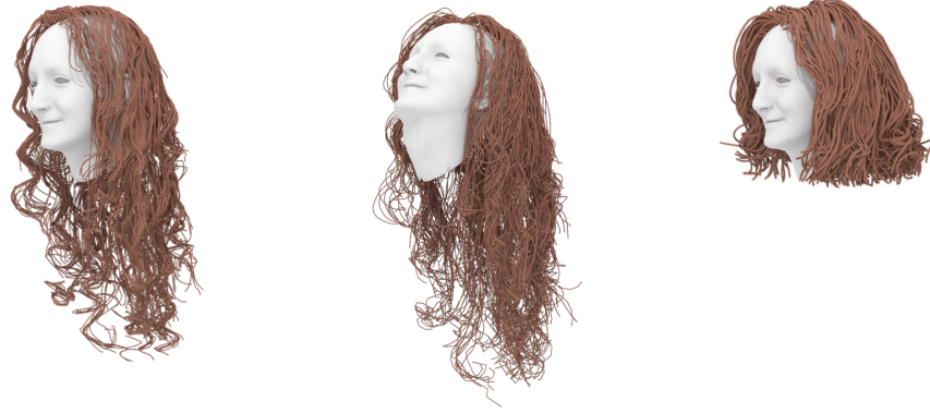
Fig. 4: Real curly wig (left) captured from [11], inverted by our method in [6] and physically animated (middle) and trimmed (right).

In the presence of contact and friction, Coulomb sticking constraints have to be considered, which makes the overall inverse problem nonsmooth and ill-posed. We have shown that assuming known mass and stiffness, as well as a simplified inverse model, it is possible to recover a plausible natural shape as well as frictional contact forces at play [6]. This work allowed us, for the first time, to animate in a plausible way a few hair geometries stemming from recent hair captures (see Figure 4).