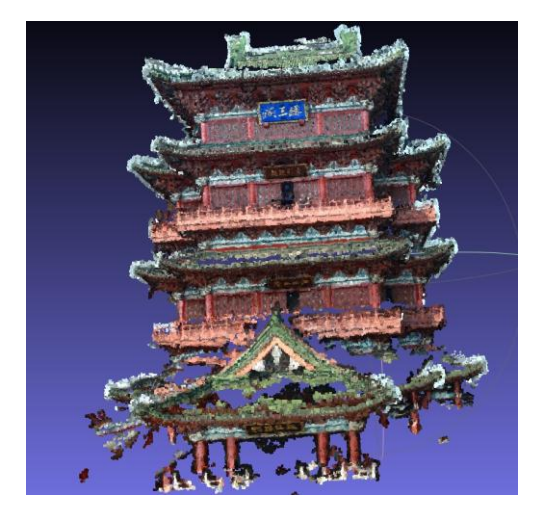
Fig.4. The rendered model of the Tengwang Pavilion