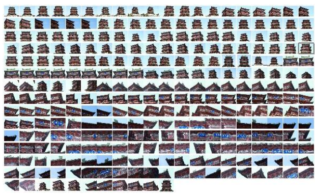
Fig.2. The 291 images captured from different perspectives of the Tengwang Pavilion

Fig.3 gives the point cloud of the Tengwang Pavilion after three dimensional reconstruction. And Fig.4 gives the rendered model of the point cloud used the open source package, MeshLab1. Because there are many tourists wandered around at the bottom of the Tengwang Pavilion during taking pictures, the point cloud seems to be incomplete at this part. However, in addition to this part, the data remains intact.