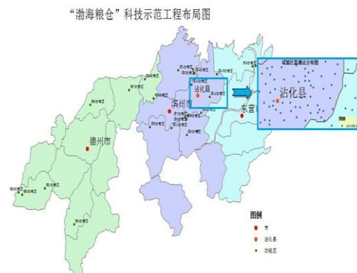
Fig.2. Acquisition node distribution