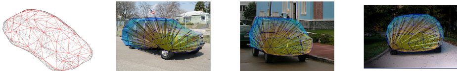
Fig. 1. Our approach models a three-dimensional object in terms of a graphical model, where the nodes correspond to 3D part positions and the edges encode geometric constraints between part positions. Given an input image and a viewpoint estimate the cost function of our energy model dictates the optimal placement of the parts in three dimensional space , obtaining a reconstruction of the object’s surface from a monocular image.

somehow introducing knowledge about the 3D geometry of an object through a model-based approach.