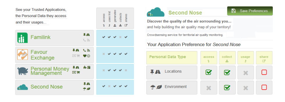
Fig. 3. Example Trusted Applications: app list (left); user settings for air-quality app (right).

compliance with the application Statement and the user settings. Applications could be certified on the basis of their exclusive usage of "trusted and transparent" APIs.