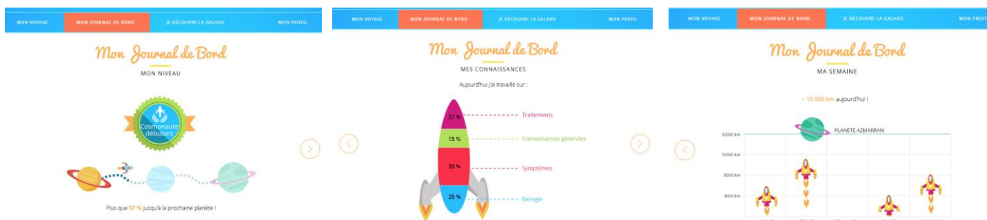
Fig.2: Visualization of what the child does on KidBreath (left : level reached; center : subjects seen today; right : time spent this week)

Because more the system is easy to use, more the objective will be reached with efficacy, efficiency and satisfaction (ISO 9241-11), we first checked the ergonomic criteria of Bastien&Scapin(Bastien & Scapin, 1993)and then we plan to evaluate KidBreath 's usability with the System Usability Scale (Brooke et al., 1996).