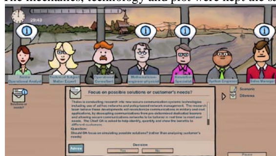
Figure 1 – Strategic Decision-Making game. Image and game courtesy of T-Xchange

The game was designed to train experts to make decisions based on incomplete or conflicting data and subsequently provide insight into their own decision-making process [14]. In the game, the player was confronted with a scenario about an important person that went missing. As the head of a crisis team, the player is tasked to make decisions based on advice that is provided by a number of experts in his or her team. In a 2x2 design, both the visual aesthetics and the story setting were either familiar or fantasy. The mechanics, technology and plot were kept the same.