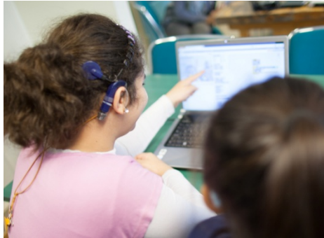
Fig. 2. Children worked collaboratively and communicate with the assistance of the visual programming language

Throughout the workshop, children worked in dyads and developed in total six interactive projects. Children worked collaboratively with the assistance of the visual programming language (see figure 2); record of children's activities was kept through photographs, videos, observation-reports and surveys from the experts; this information was used to evaluate the workshop and as an input experience for the next phase of the study.