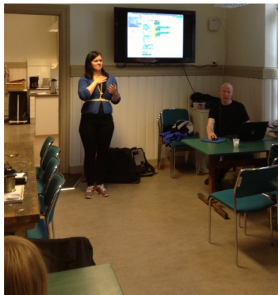
Fig. 1. The context of the game coding workshop

Twelve 12-year old children with DHH from the Deaf school of Trondheim in Norway participated in the game coding workshop. The workshop took part in the Norwegian Deaf Museum (see figure 1, for the context of the workshop). The schedule, the infrastructures and the main goal of the workshop were based from knowledge we obtained from prior similar experience [5] [6].