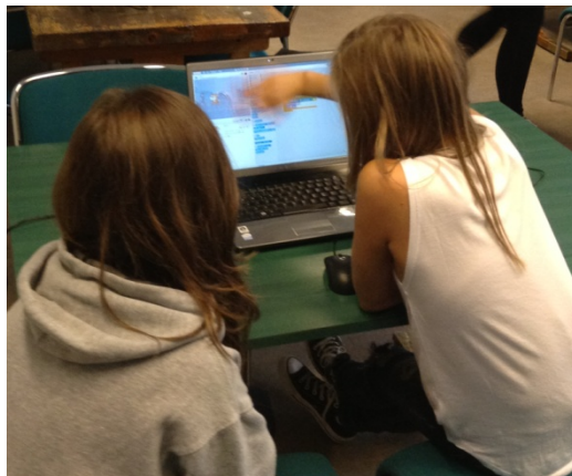
Fig. 4. Child-Programming Environment Interaction with the assistance of the camera

The findings from the exploratory evaluation clearly demonstrate the need for improving DHH children programming experiences. To do so we need to design more accessible and closer to their needs environments by addressing a variety of visual child-programming environment interactions (e.g. Figure 4). Taking this into account, in the next section we analyze qualitative data in order to give some first insights.