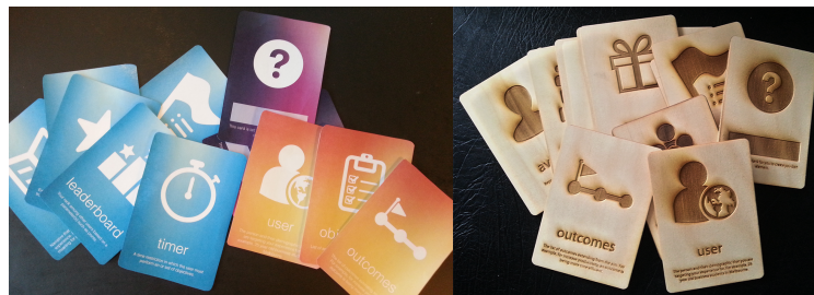
Fig. 3: Paper (left) and wooden (right) prototype.

These cards can be used for any other elements that the designer wishes to incorporate as part of the gamified approach.