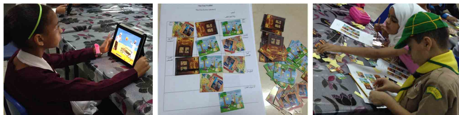
Fig. 2. Images from the Experiment

The ‘fun sorter’ instrument provided insight into the reading intervention the children enjoyed the most, the reading intervention children found the easiest to use and the reading intervention that contained the most interesting stories. Additionally, we found out which reading intervention children would select to read again.