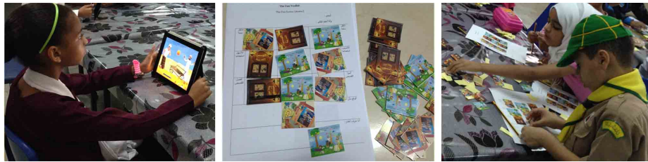
Fig. 2. Images from the Experiment

The ‘fun sorter’ instrument provided insight into the reading intervention the children enjoyed the most, the reading intervention children found the easiest to use and the reading intervention that contained the most interesting stories. Additionally, we found out which reading intervention children would select to read again.