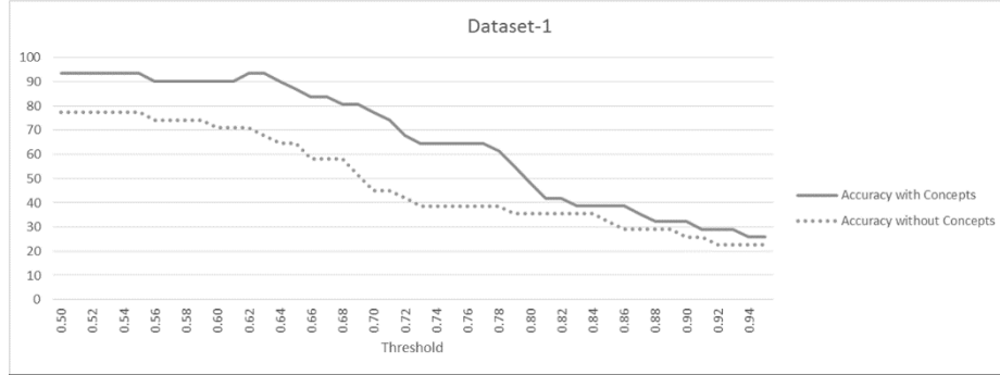
Fig. 1. The curves comparing the performance on Dataset-1 with and without using concept similarity