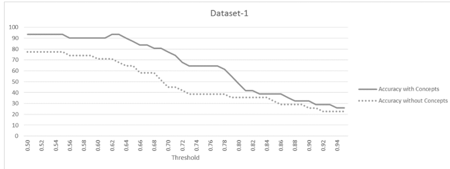
Fig. 1. The curves comparing the performance on Dataset-1 with and without using concept similarity