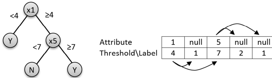
Fig. 1. Decision tree and corresponding structure

The representation for the genotype–phenotype mapping is crucial element of a search space algorithm. We believe that tree-based representation for the candidate solution is the best one and natural. Each individual is stored in breadth-first order as an implicit data structure in two arrays (see Fig. 1). All nominal data and class labels are maps to an integer, so each component is a numeric (integer, real or null). Assuming that node has an index i , its left child can be found at indices 2i and the right child at 2i+1 respectively (see Fig. 1). Terminal nodes assume null values and class number. The root has always index one. This method do not wastes space (even if the tree is not a complete binary tree) by using sparse matrices in Matlab environment. Advantages of such representation are more compact storage and better locality of reference in a context of memory utilization.