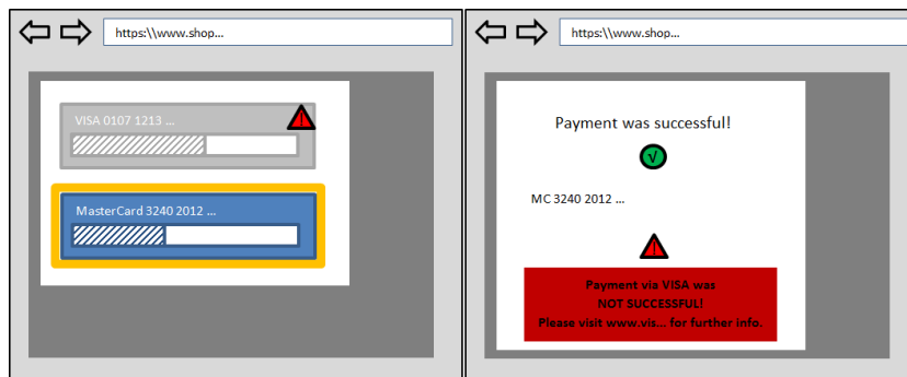
Fig. 2. Online payment scenario prototype excerpt