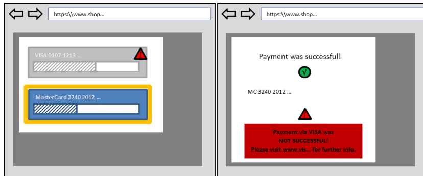
Fig. 2. Online payment scenario prototype excerpt