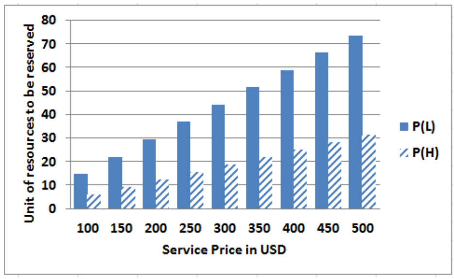
Fig. 1. Resource prediction for different types of customers, according to different services.

Figure 2 shows the premium amount to be paid, according to service type. Premium amount is shown on the top of the bars, in USD, while the values at the bottom represent the total price of services, in USD. Premium amount of each of the 9 services is shown.