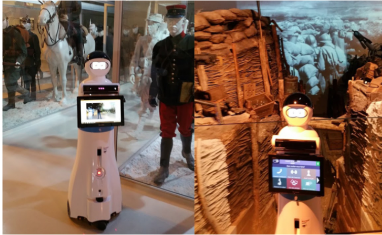
Fig. 1. The Kompai remotely controlled mobile robot in front of two emblematic scenes of the Museum of the Great War in Meaux, France: soldiers in uniform and a French trench.

front of some scenes, for proposing linked multimedia resources, etc. These tools rely on the exploitation of semantic descriptions of the scenes, of the objects in the scenes, of possible locations/orientations for observing a scene, and more generally, of topology constraints (distances, time to go from one location to another, on board camera field of view, etc.). We designed the Azkar Museum Ontology (AMO) and created an RDF dataset. During the planning of the visit, this dataset is queried in combination with the Web of Data to retrieve relevant multimedia resources to propose to the visitors, and during the visit, requests are triggered in certain situations (geo-localization, time elapsed) in order to take or suggest decisions (display this video, go to the next location).