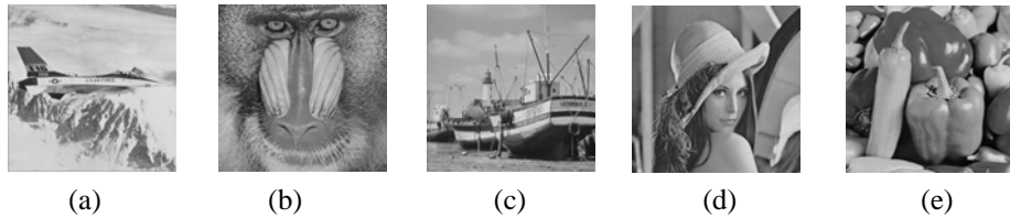
Fig. 2 The cover images with size 512 \times 512 ; (a) Airplane; (b) Baboon; (c) Boat; (d) Lena; (e) Peppers.

where MSE is the mean square error between the cover image and the stego-image.