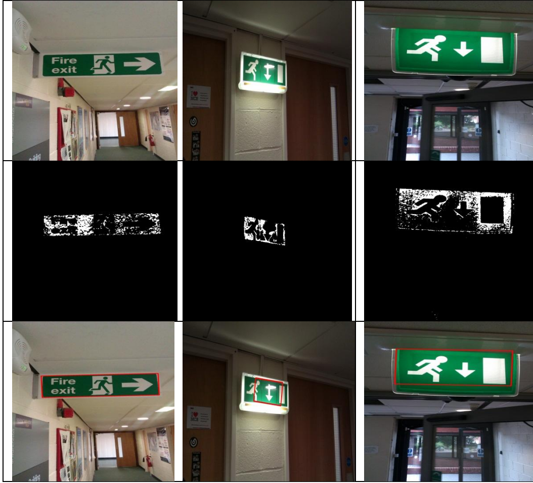
Fig. 3. Row 1: Original Exit sign Image; Row 2: Backprojected Image; Row 3: Tracked region of the exit image.