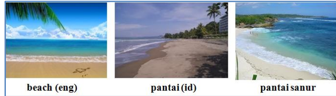
Fig. 1. Image-Language Semantic

Another motivation of this research is the possibility of image-language semantic, which based on the idea of finding semantically related text in visually-similar images. This idea offers alternative way of exploring relationship among term's meaning across languages that could be used to build thesaurus, dictionaries, question answering modules etc. The argument is that similar images might contain text caption that is possibly related. For instance if we can recognize the similarity among images in Figure 1, then we might draw inferences that word 'beach' is related with 'pantai' and 'sanur'. Moreover, with some work on the reasoning part, we also can infer that 'sanur' is a 'beach' and 'pantai' is translation of 'beach' in Indonesian language.