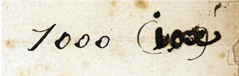
FIGURE 2: Detail view of the tag price and of the reserve price (in parentheses) for entry #5 (a violin by the Cremonese maker Giuseppe Guarneri ‘filius Andreae’). The reserve price, first indicated in unencrypted text, was written over with the encrypted version. Some elements of the number are still visible, in particular of the ‘7’ beneath the ‘i’.

From various indirect observations, we assessed that purchases and sales of used instruments were reported from before 1842 to ca. 1921. Additional remarks on attributions or later owners were added until 1951 at least. From instruments #1 to #351, initial indication of the ‘A’ and ‘C’ values in non-coded, Arabic numbering was later overwritten by the encryption (Fig. 2).