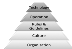
Fig. 3. KM facilitators at SENAI system

In parallel to the work conducted over the technical networks, SENAI has launched a huge initiative in order to build (in all senses of the word) a network of innovation institutes across the country (25 of them have been planned so far, including embedded systems, mineral technology, electrochemistry, etc.) knowing in advance that SENAI institutes must be free to collaborate among themselves according to the business opportunities. As part of this work and in perfect harmony with the technical networks (now these networks involve not only RDs but also innovation institutes), an ongoing work focused on the use of Knowledge Management (KM) concepts and practices was started, in order to help creating a KM-oriented culture, a KM way of working, a KM environment. It is worth noticing that such a work was not targeting the development of “yet another KM tool”; rather, the idea was to put technology as the last bit of the work and to consider it only (and if only) deemed really necessary.