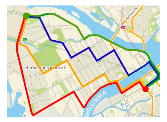
Fig. 1. Transportation network of Vasileostrovsky district of Saint-Petersburg.

Consider Fig. 1. Denote two areas: origin area (red bold circle) and destination area (green bold circle). Moreover there are 4 potential routes from origin to destination: red line, orange line, blue line and green line.