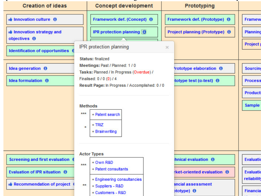
Fig. 3: Screenshot from the SmartNet Navigator, suggesting actor types for the crucial activity “IPR protection planning” [14]

The SmartNet Configurator comprises also a set of executable methods that can support network coordination. Templates and step-by-step instructions are provided to apply for example a partner profiling to identify the right partner at the right time or to perform the above-mentioned Networking Failure Mode and Effects Analysis.