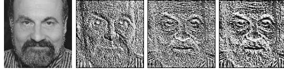
Fig. 2. An example of the original image and the LBP image after applying the original LBP , LBP_{8,1} and LBP_{8,2} operators