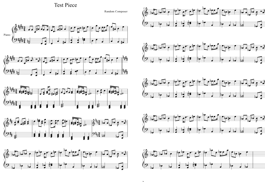
Fig. 5. Example piece of the form of mazurka .

During the experiments a few hundreds of music pieces of various forms ( polonaises , mazurkas and nocturnes ) and quality were generated by the system. Some of them clearly sound "artificial" and by no means may pretend to be composed by a (non-novice) human composer. There are, however, also quite many examples of "more human-like" compositions. An example of such a piece (of the form of mazurka ) in presented in figure 5.