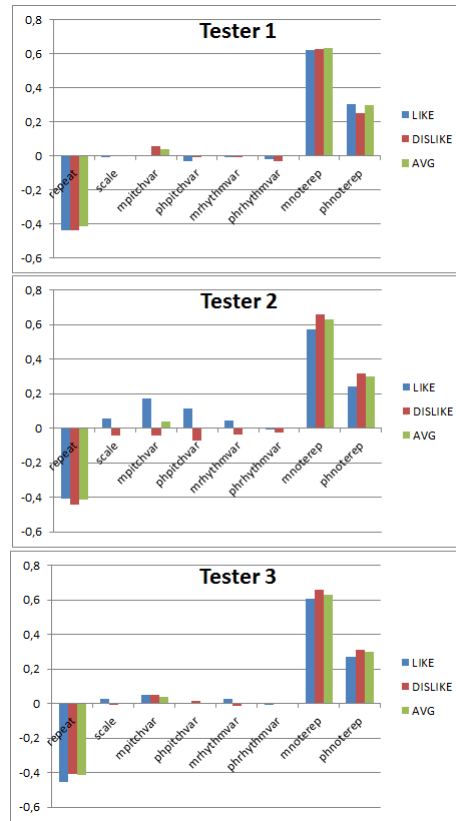
Fig. 3. Average values of style parameters of pieces highly evaluated by the testers (evaluations of 0.5 and 1) and pieces low evaluated (evaluations of -1 and -0.5) in comparison to averages of style parameters in the whole population.

(see Fig. 3). The analysis of these graphs allows to observe that the testers have different style parameters in the pieces they prefer. For instance, it is easy to observe that Tester 2 negatively judges pieces with low repetition rate of motives. The same pieces are evaluated higher by Tester 3 or Tester 1 positively evaluates pieces with low variance of notes height in motives, unlike Tester 2.