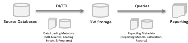
Fig. 1. General scheme of DW/BI data flows.

The ability to find ad-hoc answers to many day-to-day questions determines not only the management capabilities and the cost of the system, but also the price and flexibility of making changes. The dynamics in business, environment and requirements ensure that regular changes are a necessity for every living organization. Due to its reflective nature, the business intelligence is often the most fluid and unsteady part of enterprise information systems.