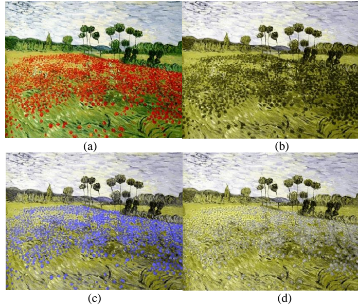
Fig. 2. For quantization to 256 colors: (a) Initial image, (b) Protanope perception, (c) Method 1: Protanope perception, (d) Method 2: Protanope perception.

Figure 2 demonstrates the result of applying both methods in Van Gogh’s “Field of Poppies”. It is evident that Method 1 has more a distinguishable effect from Method 2 and therefore it is considered more adequate to model the color difference for the specific image.