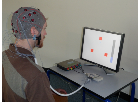
Figure 1: Experimental apparatus. A participant wearing an EEG headset tries to select one of the 3 flickering targets by focusing on it. The progression bar, visible on the right of the screen, indicates how many trials have been successful so far.

However, it is well-known that the error rate of BCI systems remains much higher compared to other input devices. This is probably the reason why current BCI research is mostly focused on improving the robustness of EEG signal-processing and not on studying the user experience of BCI