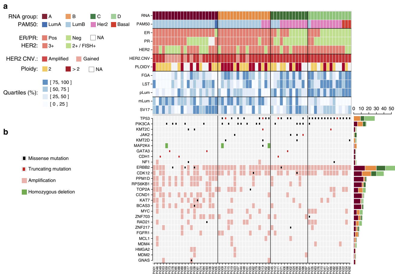
Figure 1 | Summary of biological and genomic features of the 64 sequenced HER2 + tumours. (a) (From top to bottom) RNA expression groups; PAM50 subtypes; ER, PR and HER2 IHC statuses; HER2 CNV status; estimated ploidy; Fraction of genome altered (FGA) quartiles; number of large scale transitions (LST) quartiles; progenitor luminal gene signature (pLum) quartiles; mature luminal gene signature (mLum) quartiles; number of intrachromosomal SV in chromosome 17 (SV17) quartiles; (b) mutations, amplifications and homozygous deletions observed in a selected set of putative driver genes.

hotspot mutations (Supplementary Data 2). MAP2K4 displayed HD in three ER + cases and GATA3 displayed three frameshifts. Six ERBB2 missense mutations were observed in four tumours including two in the kinase domain 31 . To assess if modifications of potential cis -regulatory regions could also contribute to differences between the four expression groups, we studied somatic SNVs in these regions by looking at a combination of histone marks enriched in regulatory region and FANTOM5 enhancer and promoter annotation 32 (Methods). An under-representation of SNVs located in H3K4me1 and H3K27ac enhancers was observed in ER + tumours ( P = 8 \times 10^{-3} , Mann-Whitney U -test) and in group A ( P = 8 \times 10^{-3} , Kruskal-Wallis test; P = 6 \times 10^{-4} , Mann-Whitney U -test, A versus BCD) (Supplementary Fig. 2d,e).