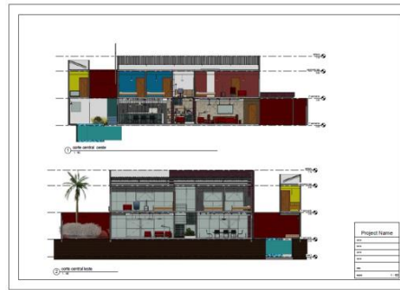
Fig 4 – Humanized Sections

The PBL model permitted to some students to learn some topics and change knowledge between colleagues, becoming the process very rich. Both tools permitted the analysis of all project instances (structure, masonry, electricity and hydraulics) with a good precision. Besides, the teams who adopted BIM solutions had more efficient projects representation than the teams that used CAD tools, what could inflict that the software could interfere in the process of project development. To investigate this fact, there was made, by the professors of the activity, a criteria analysis to understand this fact.