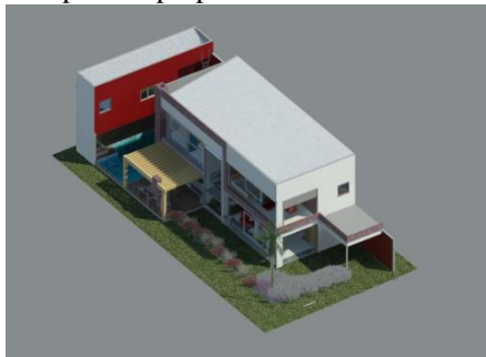
Fig. 3 – Perspective

Each group presented the work to the professors, defending and discussing their ideas. Fig. 3 and Fig. 4 are examples of some works that were developed. All teams developed the proposed activities.