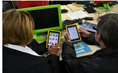
Fig.3. Illustration of the use of tablet

Figure 3 illustrates the use of the equipment described.