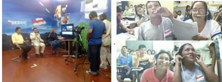
Fig.1. Ministering teachers Assistant teachers and students

In this model presented, ministrant teachers interact remotely with teaching assistants and students, interconnected via satellite by multipoint Interactive Digital TV over IP, with an appropriate and necessary interactivity as illustrated in Figure 2.